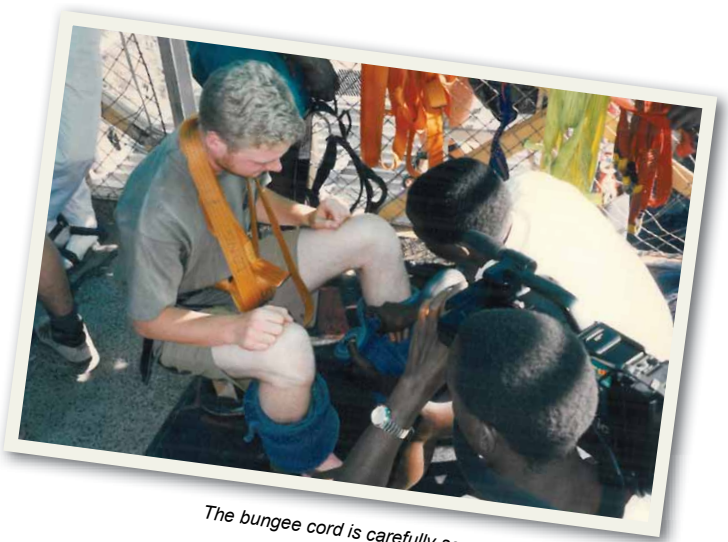
The bungee cord is carefully secured to both legs.

He bought his ticket and signed a release, then we had to walk across the bridge to the Zambia side to sign another