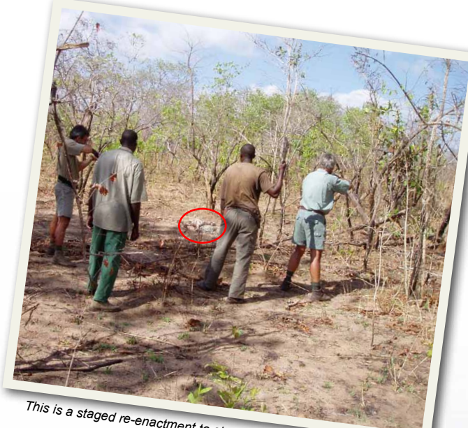
This is a staged re-enactment to show the final position of the leopard, in the red circle.

Experienced professional hunters prefer to follow-up wounded leopard with a seasoned partner, not the client; because a wounded leopard almost always charges and they come so very, very fast. It is a few kill or be killed seconds, although leopard typically claw and bite everyone in the party, then run back into the bush – which ends the follow-up. A wounded leopard is a serious, serious problem, and no professional hunter looks forward to it.