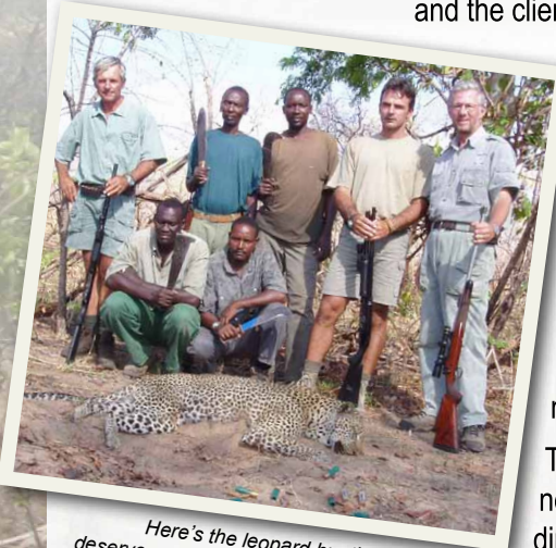
Here's the leopard hunting crew. I don't deserve much of the credit for this trophy. Note the empty shells in the foreground.

Putting a killing shot into a leopard should be pretty straightforward, as the distance is typically only 25-40 yards and the client is normally sitting