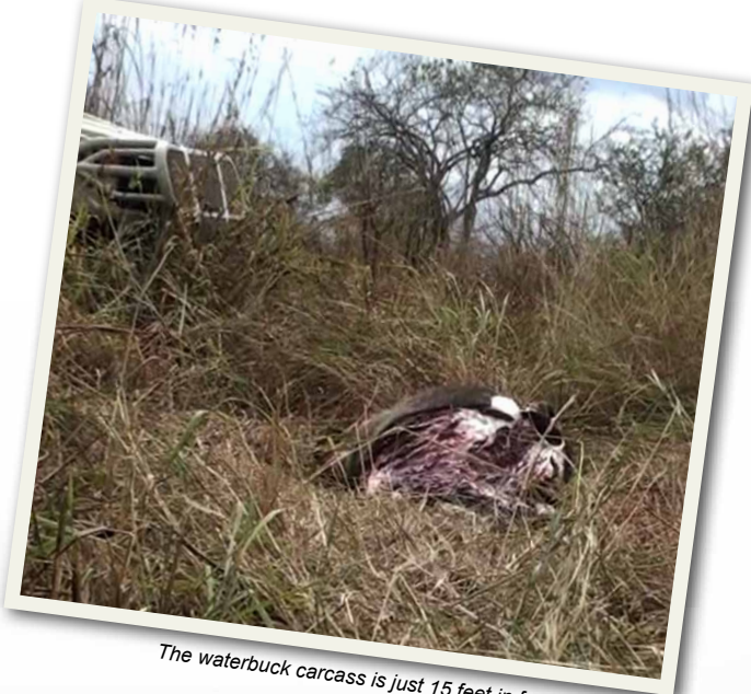
The waterbuck carcass is just 15 feet in front of the blind, with the safari car in the rear.

Now, comes the interesting part. We had just shot a waterbuck and were keeping only the front skin and the horns. The sky was filling up with vultures and this looked like a great opportunity to get really, really close to them and observe their feeding frenzy; so we constructed a small blind just 15 feet from the carcass. It didn't take much, just a few sticks, some netting and of