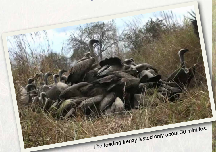
The feeding frenzy lasted only about 30 minutes.

Barani Camp Selous Game Reserve Tanzania, Africa 7 July 2009