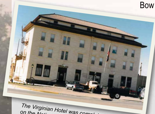
The Virginian Hotel was completed in 1911 and put on the National Register of Historic Places in 1978. Yes, you can still get a room there.