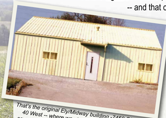
That's the original Ely/Midway building -7450 Old Highway 40 West -- where we started up in 1977 (32' x 48' [1536 square feet]). This picture was taken years later, after the chain link security fence was removed.

7450 Old High 40 West Columbia, MO December 31, 1984