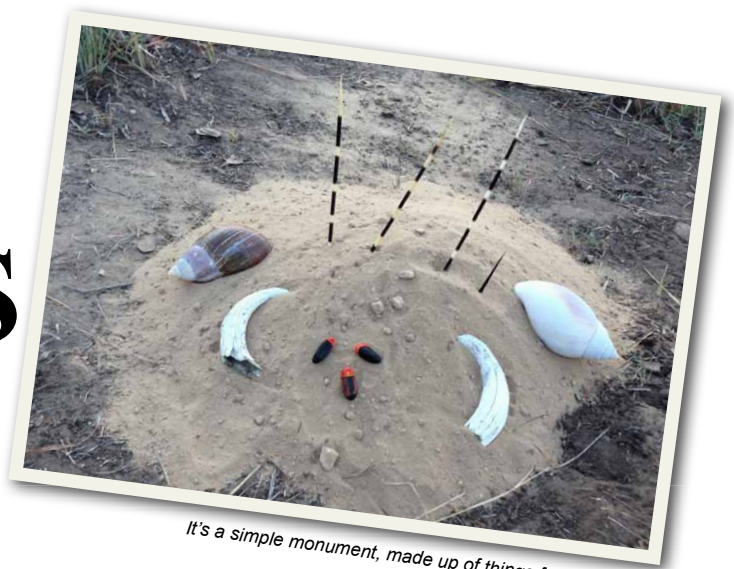
It's a simple monument, made up of things from the land.