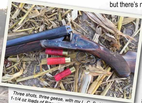
Three shots, three geese, with my L. C. Smith 12 gauge and 1-1/4 oz loads of Bismuth #5 shot. The shots were close and I used improved cylinder and modified choke tubes.

One of the important variables to success is the timing of the corn harvest, because the geese begin feeding in the corn fields as soon as the farmers pull out. This year, because of dry weather, the corn came out right on schedule and the geese moved in. Another variable is choosing the right field to hunt; you have to pattern the geese. There's a good chance that the field they feed in tonight will be the same one they fed in last night – but there's no guarantee.