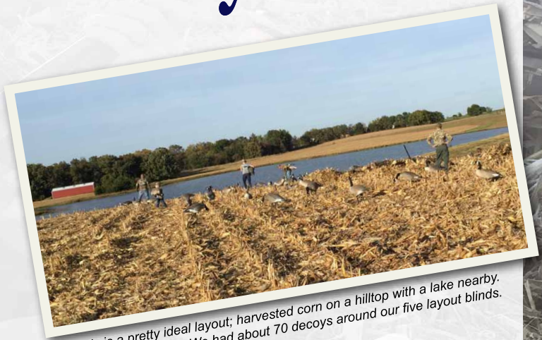
This is a pretty ideal layout; harvested corn on a hilltop with a lake nearby. We had about 70 decoys around our five layout blinds.

Larry Potterfield Coats Place Farm Columbia, Missouri 10 October 2015