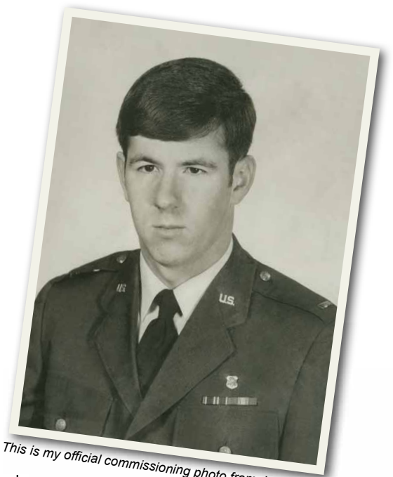
This is my official commissioning photo from July 1974.

The assignment couldn't have been better. The Hospital Squadron was about 350 soldiers, and all were top notch. From the doctors, nurses and administrators to the maintenance folks and cooks; everyone worked together as a team. My boss had a motor home and a boat – and liked to hunt. I had decoys and knew how to blow a duck call. There was lots of hunting and fishing, and shooting – including skeet and prairie dogs.