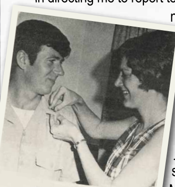
Pinning the gold