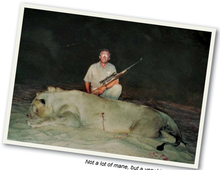
Not a lot of mane, but a very big and old lion.

He came early; we heard him roaring from a mile away and he made a steady advance just at dusk – roaring every few minutes. The PH had me keep down until he got a