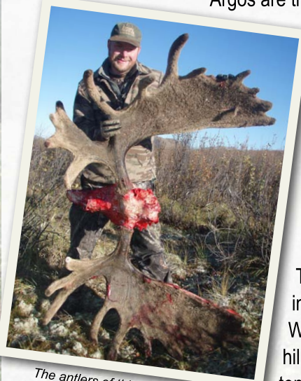
The antlers of this Alaska-Yukon moose measured 72" in extreme width.