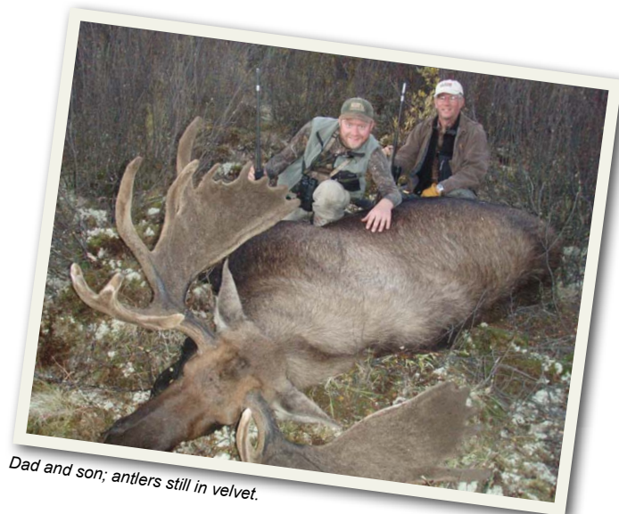
Dad and son; antlers still in velvet.

Shockey's private spike camp was our hunting area and we promised not to share its location with anyone. It was very remote, with lots of game. One day Russell and Jim were focused on what they called the 'pretty' moose in a group of four. He wasn't extremely wide, but had points across the