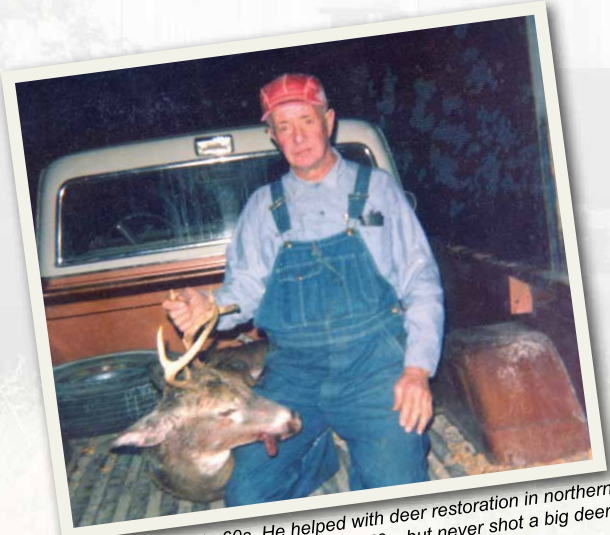
Dad in his late 60s. He helped with deer restoration in northern Missouri in the late 1950s, but never shot a big deer.