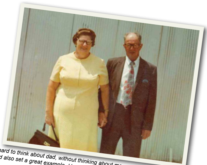
It's hard to think about dad, without thinking about mom; she was always there and also set a great example. Here they are dressed for church, about 1972.

I remember a few of dad's stories: one about him climbing into a tree to get a raccoon out of a hole and dropping his