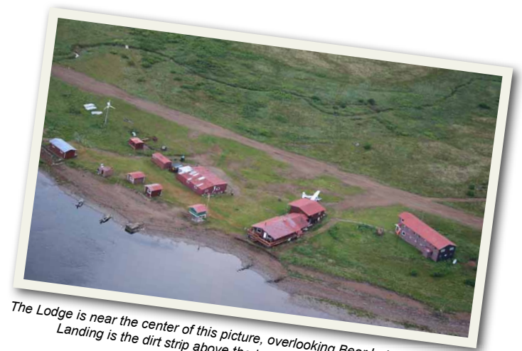
The Lodge is near the center of this picture, overlooking Bear Lake. Johnson's Landing is the dirt strip above the buildings.