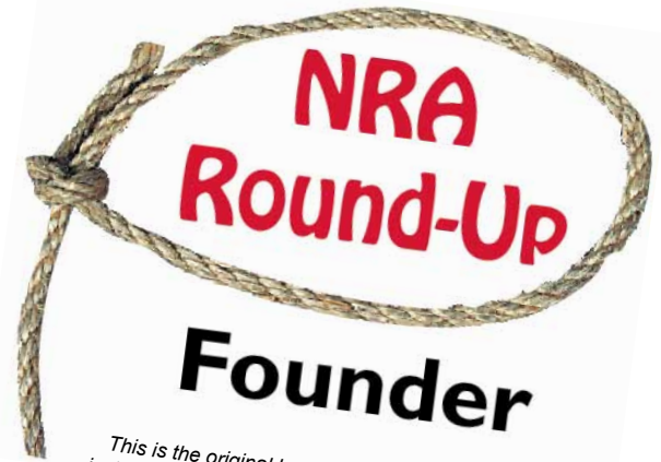
This is the original logo. We developed it at MidwayUSA in 1991 and gave it to the NRA, so they could trademark it and authorize other businesses to use it.