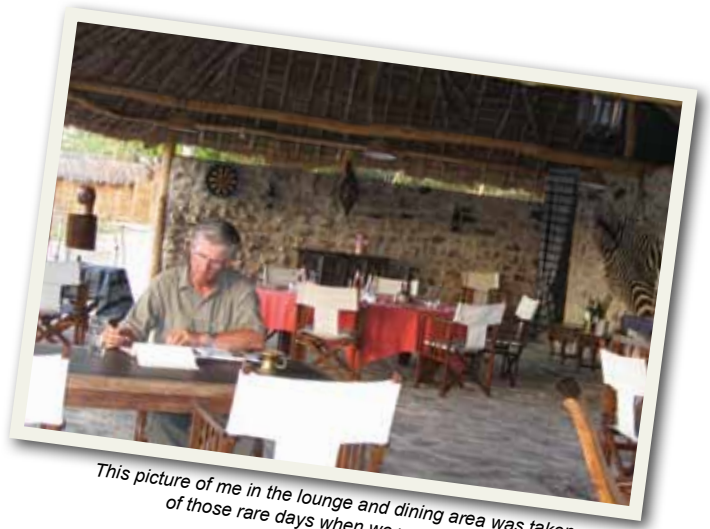
This picture of me in the lounge and dining area was taken on one of those rare days when we were back in camp for lunch.

The tents are spacious (three bays), with gun racks and chairs in the front bay, beds in the center and clothing racks and a laundry hamper in the back. Out the back tent flap is the attached, enclosed, but not covered bathroom annex — with a shower, wash basin and flush toilet. Now