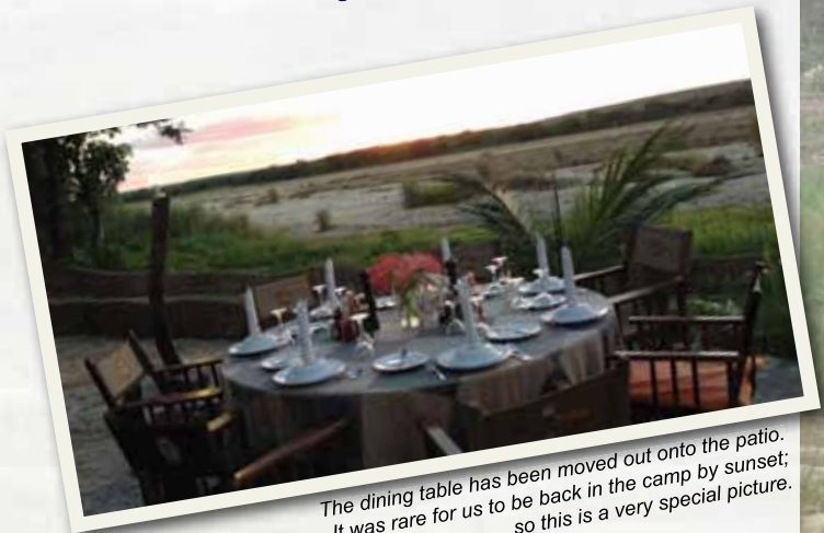
The dining table has been moved out onto the patio. It was rare for us to be back in the camp by sunset; so this is a very special picture.