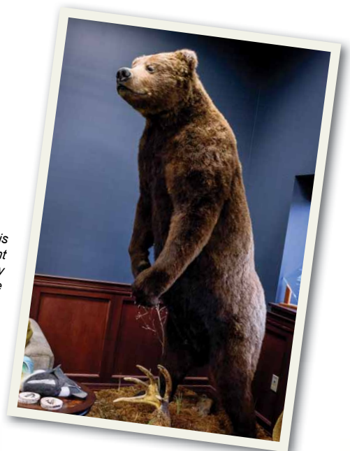
For most visitors, this big Brown Bear mount is the first thing they notice; it stands in the far corner – opposite the entrance. He’s a ten footer, taken in Alaska in 2009.

The desk is only medium in size and always seems to be cluttered with projects – sometimes really cluttered. At my level in the organization and stage of life, there are often a couple of dozen projects open at any given time. Some are about finished, while others have been going on for a long time. A few are seemingly forgotten, having had no attention for a while.