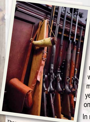
There are several gun racks in my office, many with an emphasis on black powder cartridge rifles from the 19th century.

Being “boss” of a family-owned company, a man can have just about anything in his office that his wife is supportive of. Having had this job of “boss” for nearly 40 years, there are lots of things that have found their way into my office that represent memories too important to throw out. Thus it is, that every corner has something in it; but each item is intended to create a comfortable, sentimental working environment. My strategy is to feel good when I walk in and not be embarrassed when receiving guests or giving a tour.