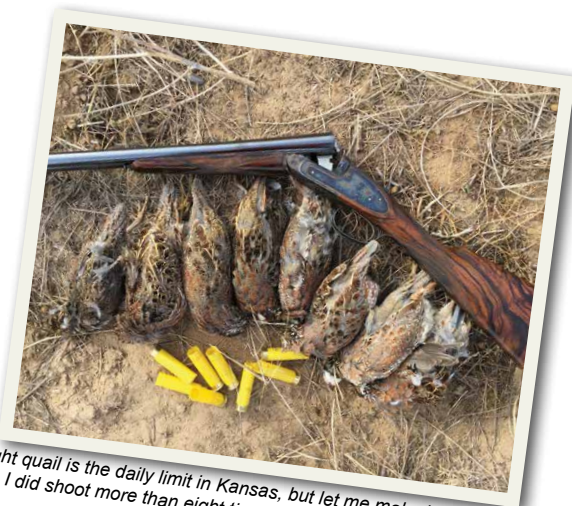
Eight quail is the daily limit in Kansas, but let me make it clear that I did shoot more than eight times with my Purdey side by side.