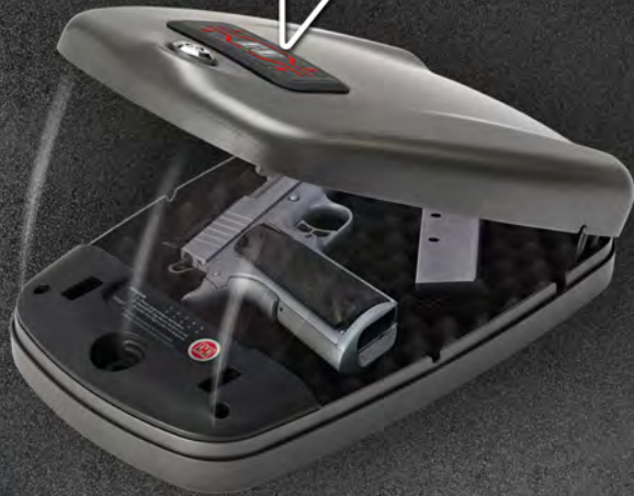
RAPiD® SAFE 2600KP & 2700KP