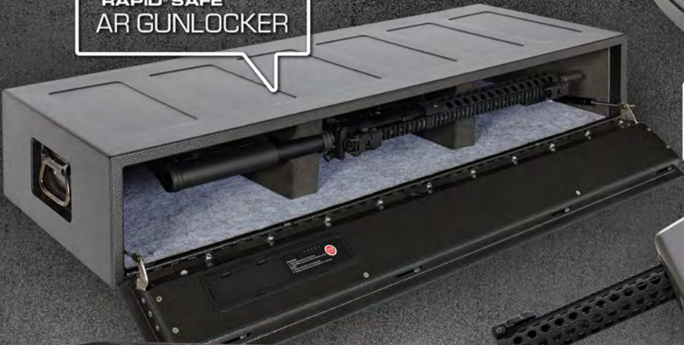
RAPiD® SAFE AR GUNLOCKER