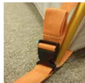
Tent Fly Side Release Buckle Attachment