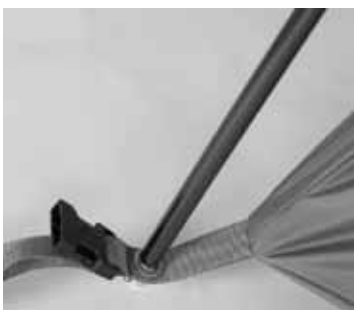
Grommet Pole Attachment

Step 2: Insert pole tips into grommets on one end of each pole. From opposite corner, flex pole and insert tip into grommet.