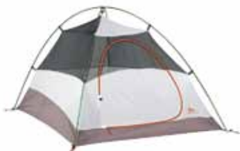
Grand Mesa 3 pictured

In order to familiarize yourself with your new tent, we recommend you "test pitch" before your first camping trip. For additional information please visit http://www.kelty.com/c-tents-shelters.aspx .