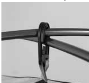
Center Pole Clips