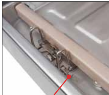
Pouch Clip Lever

Note: Once the vacuum and seal cycle is complete, lift the pouch clip lever up to remove the pouch.