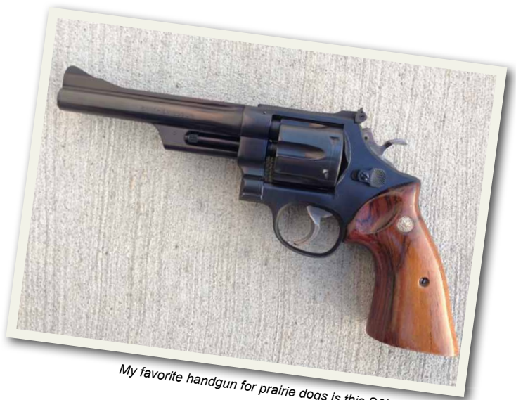
My favorite handgun for prairie dogs is this S&W Model 28.

sight picture. I've also used a Winchester low wall and a Winchester Model 92, in the same caliber, for mid-range work; but the Rolling Block is easier and more efficient to operate, as you simply roll back the hammer, then the breech block to extract the empty case and load a fresh round. The low wall and 92 require a second hand to operate the under lever. Whether walking & stalking, sitting at the bench or shooting off the truck door, this little rifle