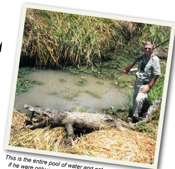
This is the entire pool of water and not much to hide in; but if he were only wounded, it would have been a nightmare to have gotten him out.

My rifle was an original Winchester Model 1895 in 405 Winchester (made in 1904), plenty of cartridge, but you have to hit a croc just right, or he immediately takes off – into the water, which they are never far from.