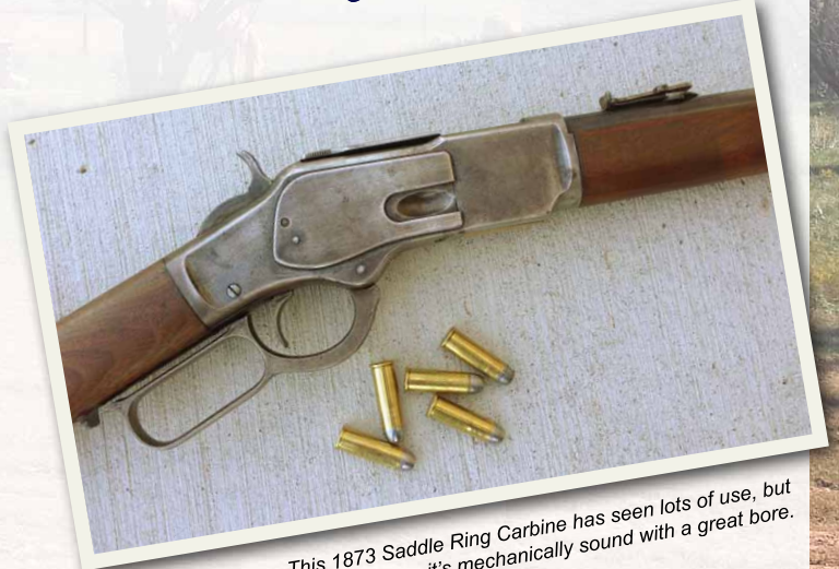
This 1873 Saddle Ring Carbine has seen lots of use, but it's mechanically sound with a great bore.

Larry Potterfield The Nail Ranch Albany, Texas 6 November 2002