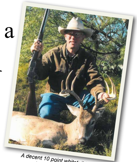
A decent 10 point whitetail taken with a Winchester 1873, made in 1892.

It had to happen sooner or later – ‘the gun that won the west’ going with me on the Nail Ranch hunt in Texas. Finding a good Winchester Model 1873 saddle ring carbine (SRC) in 44-40 was the problem; it had to be all original – not refinished or tinkered with. Also, since I like to shoot all my guns, it needed to be mechanically sound and have a great bore. And one more thing, it had to fit my budget. If you’ve ever been on the hunt for something that was almost impossible to find, you know what I went through. But finally there it was – laying on a table at the Tulsa Gun Show; and it went home with me.