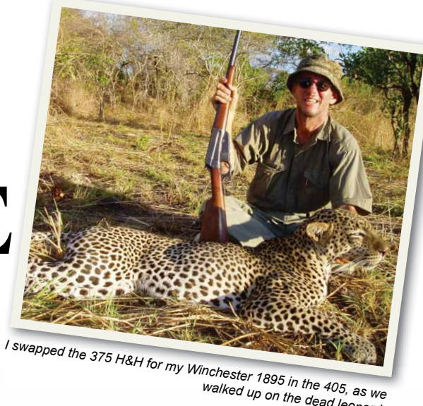
walked up on the dead leopard.

and set up in the shade of a small bush near the safari car. It sounded like the distress call of a rabbit, caught up in some life-ending struggle. We called for only a short while and out of the brush came the leopard. Slowly he walked our way, stopping on occasion and sitting on his hind legs for a few seconds, whenever we would stop calling. When the squealing started back up, he would come again. It was cat and rabbit for several minutes, as he closed the distance. The safari car was in plain sight and we were concerned, but he was walking straight into the late