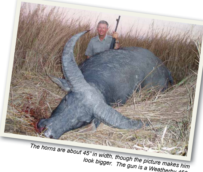
look bigger. The gun is a Weatherby 460.

The hunting was 'spot and stalk', in the pastures the buffalo shared with the cattle. Early and late they were feeding in the open areas and during the mid-day they stayed generally out of site in the brush. The grass was short on the higher ground, but taller in the low areas that held water longer after the rainy season. My buffalo was in the tall grass.