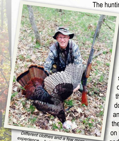
Different clothes and a few more years of experience – but same, favorite turkey gun (2014 photo).

In my opinion, the most exciting thing about springtime in Missouri is turkey season; sure there are mushrooms to pick in the woods, fish to catch in the ponds and rivers, and arrowheads to find in the ditches -- but nothing quite compares with being in the woods with our big Eastern tom turkeys during the mating season in April and May. For me, it's a time to hunt, as well as an opportunity to get some exercise and spend time with family and friends.