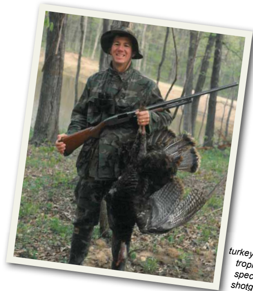
An Eastern tom turkey is always a great trophy; it's even more special with a favorite shotgun (1990 photo).

Some days it's only me, getting into the woods just after 5:00 a.m. and waking up the gobblers; then going in tight and hoping luck is on my side. But most of the time family and friends are involved; and that just makes it more special. As the mornings go on, it's true hunting, moving and calling, then moving and calling again, and again; till the morning is gone or my time or energy runs out.