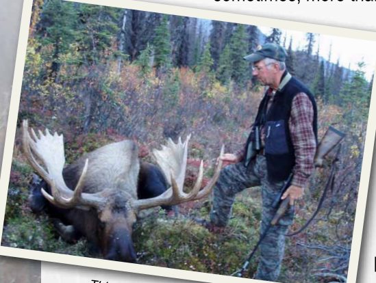
This is a typical Alaskan/ Canadian Moose. My rifle is a Rifles, Inc. custom, lightwight Remington 700 in 300 Win. Mag.

There are lots of ways to hunt moose; you can glass from the hills into the bottoms, call them in (during the rut), bump into one on the way to or from camp or float down a river and catch