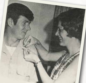
Pinning the gold