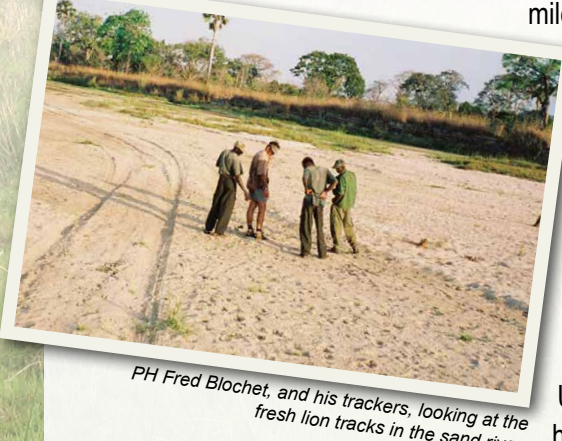
fresh lion tracks in the sand river.

eaten a little and the PH was sure he would come back the next night. We built a blind about 12 feet up in a nearby tree, then proceeded straight back to camp and returned with bedding material about 3:00 p.m. - prepared to spend the night. If the lion came early, we would shoot him; if he came in after dark, we planned to shoot at first light the following morning – before he moved off into the bush.