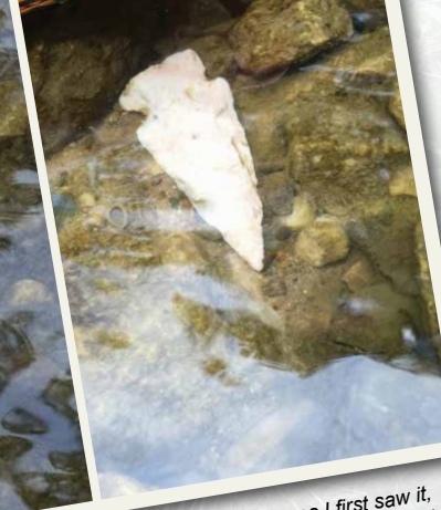
This is the last rock of my first day, as I first saw it, and after lifting it out, cleaning it up and putting it