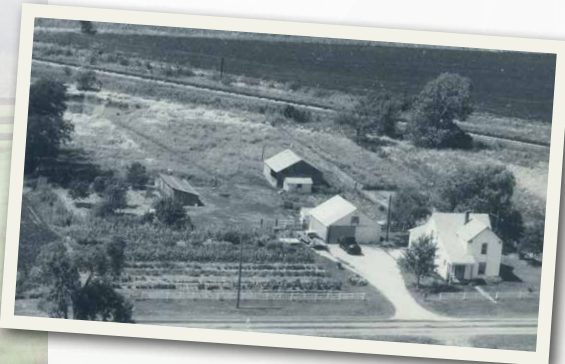
Mom and dad bought this house in Ely, Missouri in 1965 – for just over $8,000; it was the only house they ever owned and first time we had running water and a flush toilet.

“...we had no running water or flush toilets until 1965.”