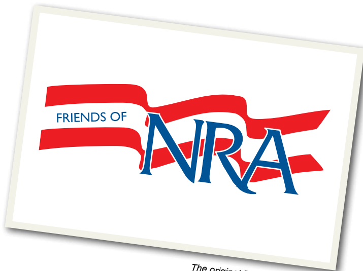
The original Friends of NRA logo.