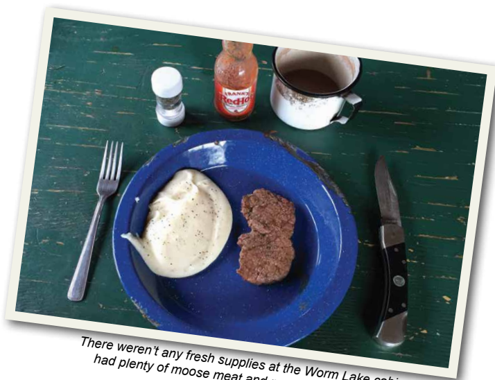
There weren't any fresh supplies at the Worm Lake cabin, but we had plenty of moose meat and mashed potatoes – from a box.

Our guides did their very best, but during the all-day ride/walk to camp, we stopped countless times to re-position