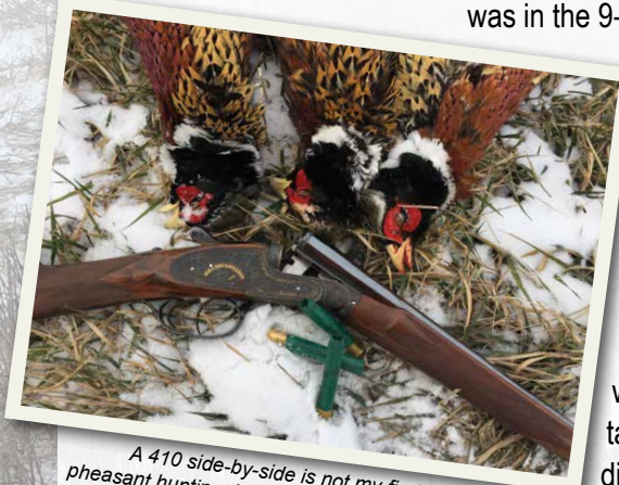
A 410 side-by-side is not my first choice for most pheasant hunting, but when they're hunkered down in the shelterbelts the shooting can be fast and close. In this case, the little 410 was all I ever needed.

"...the temperature was in the 9-15 degree range."