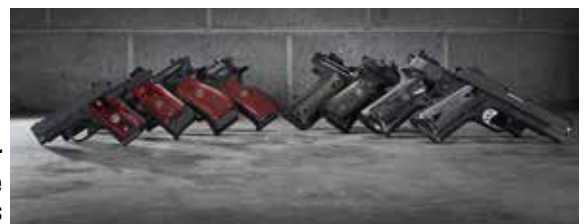
Pachmayr Renegade Pistol Grips

For Promotional Details go to www.lymanproducts.com