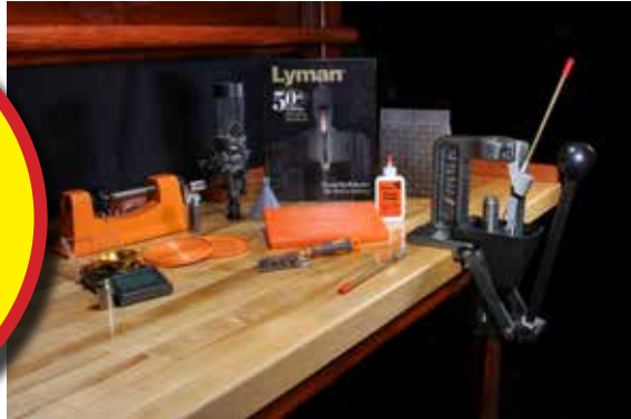
T-Mag Expert Kit Deluxe