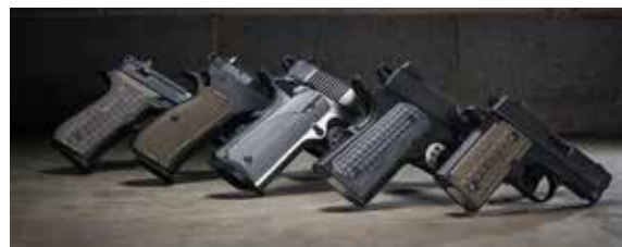
Pachmayr G-10 Pistol Grips