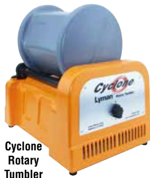
Cyclone Rotary Tumbler