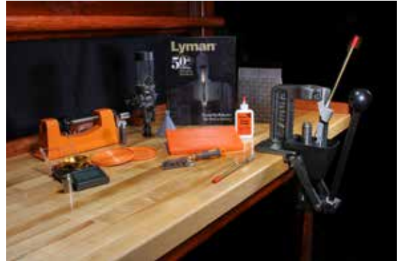
Crusher Expert Kit Deluxe