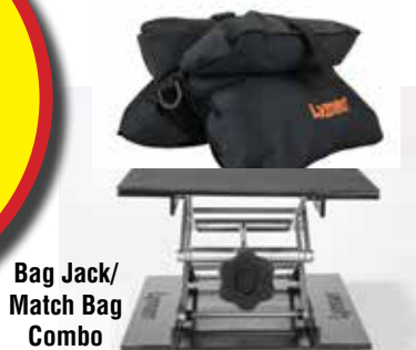
Bag Jack/ Match Bag Combo