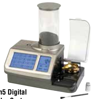
Gen5 Digital Powder System