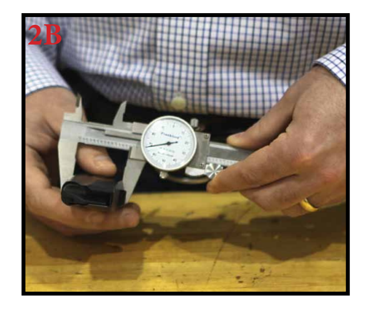
Large frame (Post 2005) Witness magazines, as pictured above measure approximately 0.843" thick (fig. 2A) and approximately 1.369" long (fig. 2B)