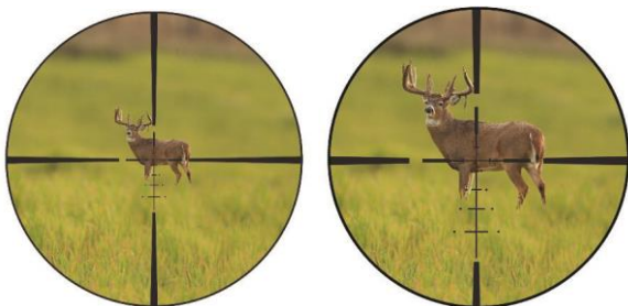
Reticle on Low Power Reticle on High Power Trajectory Compensation

All Veracity Riflescopes utilize a Front Focal Plane system. Front Focal Plane systems (sometimes referred to as First Focal Plane systems) place the reticle in front of the erector assembly or zoom mechanism. This allows the reticle to change size as magnification is adjusted. In FFP systems, when magnification is increased, the reticle size grows; as magnification is lowered, the reticle size shrinks. Because the reticle is changing with magnification, the measurements of the reticle are always correct and are proportional to whatever power setting you may be on. This also means that the trajectory compensation technology is also correct in Veracity Riflescopes at any magnification.