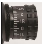
Proper Windage Zero

NOTE: Windage adjustments are made with a multi-direction adjustment knob. Zero is set with an indexing mark to allow for left and right adjustments. Failure to zero at the index mark may result in limited windage adjustment.