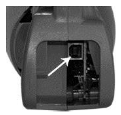
Figure 2: Inferno USB Port

The USB port is located inside the back access compartment (see Figure 4 to the right) of the Inferno. Make sure the Inferno is powered off while it is connected to your computer. After connecting the Inferno to your computer, launch the utility. The utility should recognize the device and display "Connected to..."